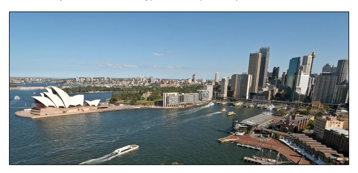
Day 16: Sydney A free day to explore Sydney at leisure.

The cruise will be led by skipper Colin, who will introduce you to the landmarks of Sydney Harbour. Lunch – sushi, salads and fruit, all washed down with your choice of wine, beer, soft drinks and followed by a sweet treat with tea or coffee – will be shared in a quiet bay. At the end of the cruise you will be delivered to Darling Harbour where you might like to explore the shops, museums, and aquarium, before making your own way back to your hotel.