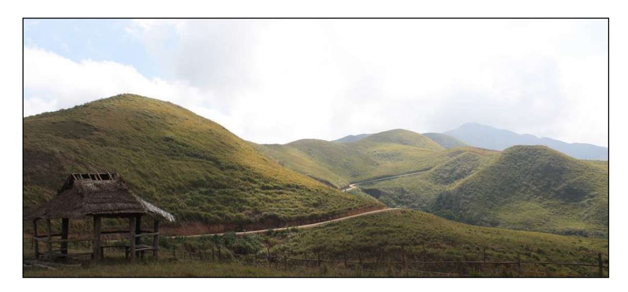
Day 7 - Luang Nam Tha to Muang La

Return to your lodge in Luang Nam Tha late afternoon. Rest of day at leisure.