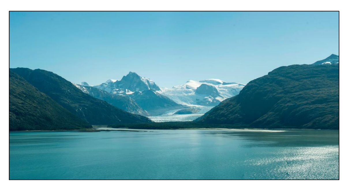
Chart a course through the labyrinthine fjords that define Chile's spectacular coastline on this 2-week expedition cruise, sailing from Cape Horn to Valparaiso with numerous stops enroute to fully explore this magnificent coastline.

The Chilean Fjords are one of nature's great wonders – a complex maze of inland passages, fjords and glaciers, which sustain a thriving coastal wildlife including large colonies of penguins, elephant seals, cormorants, steamer ducks, and migrating whales.