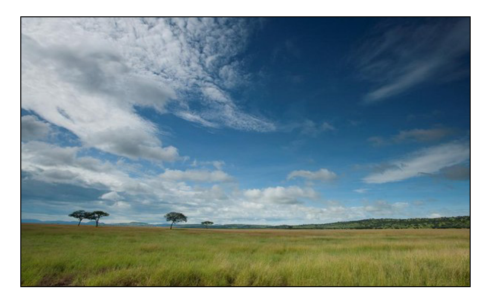
Days 6-9 Ngorongoro to Zanzibar, Matemwe Beach Lodge, 3 nights

Overnight at Ngorongoro Serena Lodge, located on the edge of the Crater and cloaked in indigenous creepers and river stone. There are 75 rooms each with private terrace and views to the crater floor.