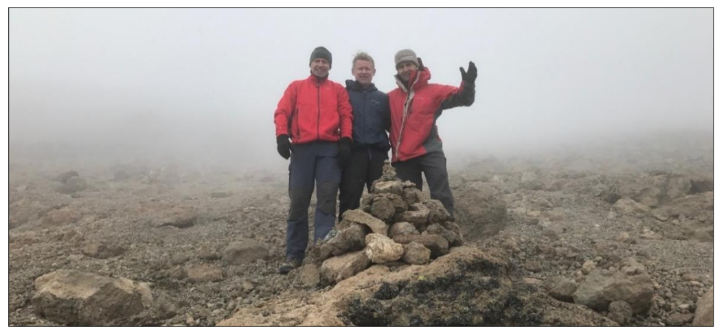
JAWA Cairn at 5,000ms

From Scree Valley Camp, we climb up a ridge and then on to the higher slopes as we approach the crater rim. Our goal today is to reach JAWA Cairn, set up in Jan 2017 by our team.