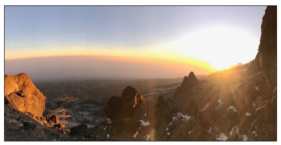
On the North side of Kilimanjaro

Join us as we open a new wilderness route up the remote North Face of Kilimanjaro!