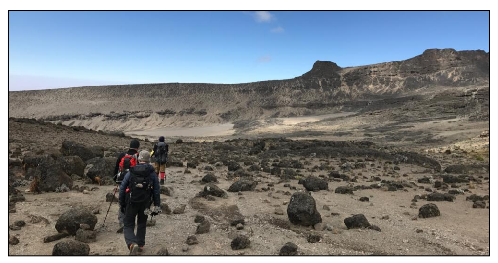
On the northern face of Kilimanjaro

Today we divert from the standard trail and head to the North West flank of Kilimanjaro, a zone that very few climbers visit. We contour below Lava Tower to reach Moir Camp (13,780ft./4,200m) - a well-located but little-used site overlooking Shira Plateau.