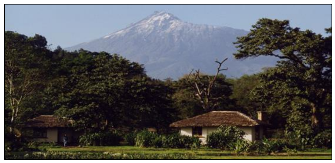
Mount Meru from the gardens of Moivaro Lodge

Moivaro is a comfortable garden lodge set in a quiet location on the outskirts of Arusha. Geared towards trekkers and safari travellers, it's a lovely spot to relax before and after your climb.