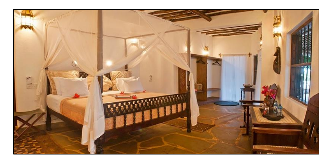
Days 2-7: At leisure At leisure at Kinondo Kwetu.

Kinondo Kwetu is booked on a fully inclusive basis. The menus are set, and served in different venues. Three-course lunches are typically served at tables on the beach, or sometimes in the garden, while dinners may be taken in the main house or privately on the beach.