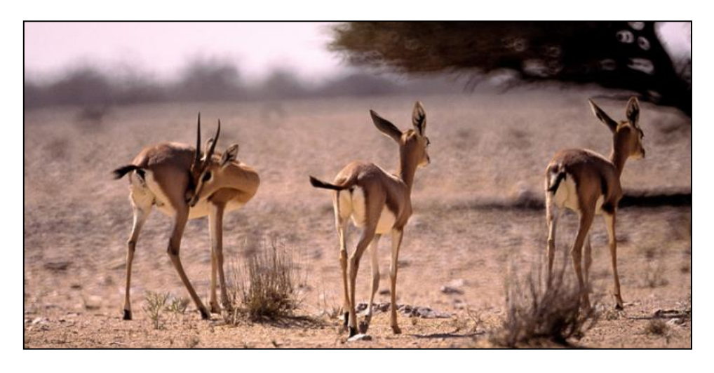
Day 7 Sur – Muscat – Salalah (4WD)

This evening, after an early dinner, pay a visit to the turtle sanctuary at Ras Al Jinz, a vital nesting ground for the endangered green turtle.