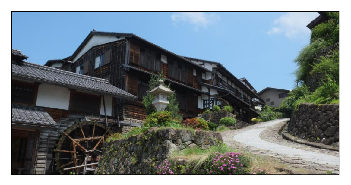
Day 6 - Takayama (B, D) Today is free for you to explore Takayama independently.

From Nakatsugawa, take the JR train to Takayama, a wonderfully atmospheric Jomon-era town that is most famous for its biannual festival. You stay tonight in a traditional ryokan in the heart of Takayama's old town. End the day with a kaiseki dinner at your traditional ryokan and a soak in Takayama's famous hot springs to recover from the morning's long walk.