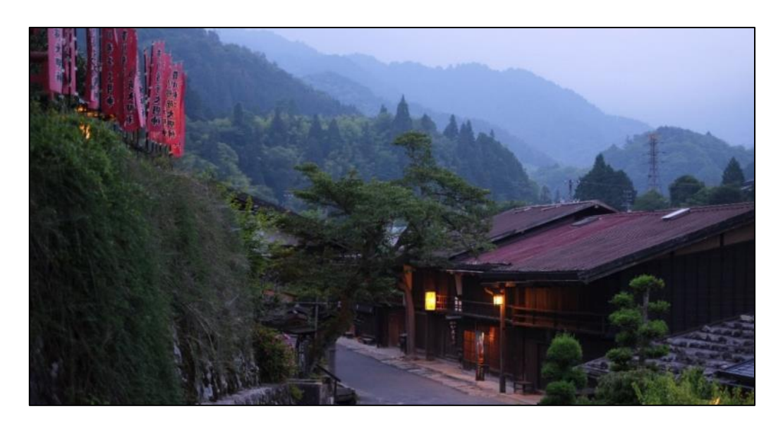
NB. Before leaving Tokyo for Kiso, we recommend having your luggage couriered to your next destination, Takayama, and carrying only your essentials with you in a day pack. Just ask the desk staff at your hotel in Tokyo to arrange this for you. If you do prefer to bring your luggage with you, you can arrange for it to be couriered from Magome to Tsumago at the Magome tourist office (at additional cost).

Tsumago is a short bus journey from Nagiso station, where your JR train arrives. On arrival, check into a traditional family-run guesthouse with tatami mat flooring, futon beds, and onsen baths. For dinner, you'll be served a tasty kaiseki (multi-course) meal fit for a samurai!