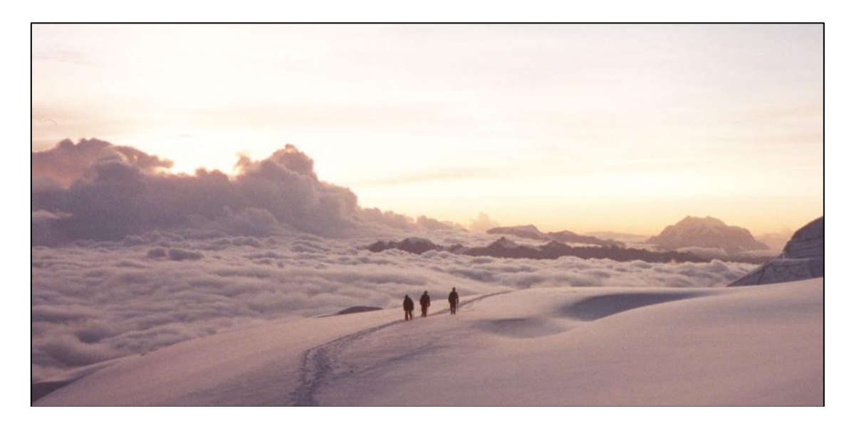
NB. Those not climbing Cotopaxi will have an extra day/night at Tambopaxi.

the refuge at 4,800m. You will have a snow and ice practice during the afternoon and go to bed early in preparation for the climb.