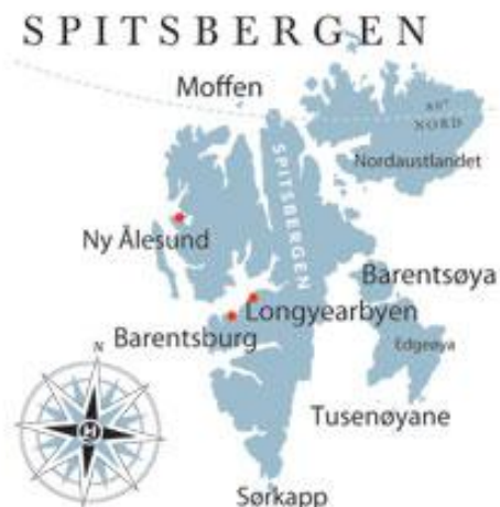
Location of Longyearbyen, Spitsbergen, Svalbard, Norway.