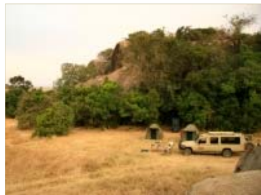
Private Light Mobile Camp Serengeti Kopjes

The word Serengeti comes from the Maasai word 'Siringit' meaning 'the place where the land runs on forever' and refers to the flat grassy plains which make up about a third of the park. It is these grasslands and savannahs that ensure that the area is jam-packed full of game. There are animals here at any time of year, but from October to May, the area teems with life, including wildebeest, zebra, impala, warthogs, topi, gazelles and hyena. From June to August the herds are moving northwards and heading into the Masai Mara. Lion, leopard, cheetah and caracal can be more easily spotted across the landscape.